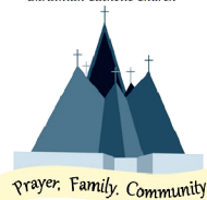
Exaltation of the Holy Cross Ukrainian Catholic Church